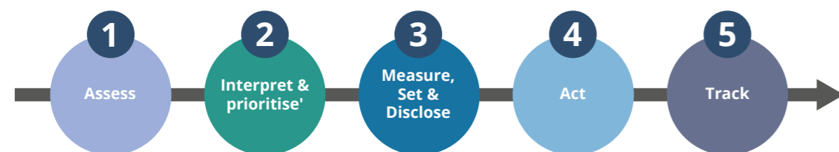
Figure 3: SBTN 5-step approach to target-setting

To set science-based targets for nature, corporates are expected to follow five steps (see Figure 3): (1) assessment of impacts; (2) interpretation of data and prioritisation of locations; (3) baseline data collection, target setting and disclosure; (4) action to meet targets; and (5) monitoring, reporting and verifying progress over time.